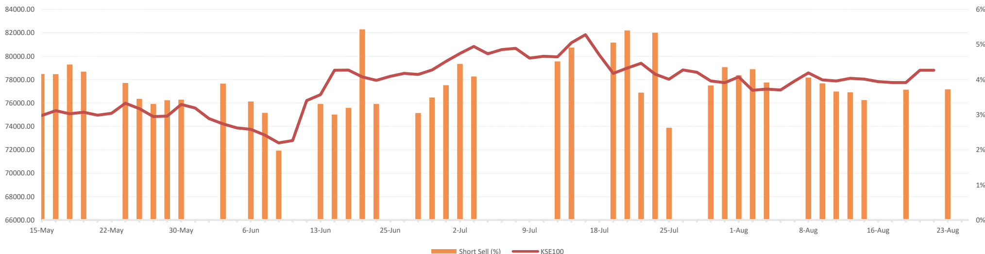
KSE-100 VS % Short Sell Of Total Open Interest